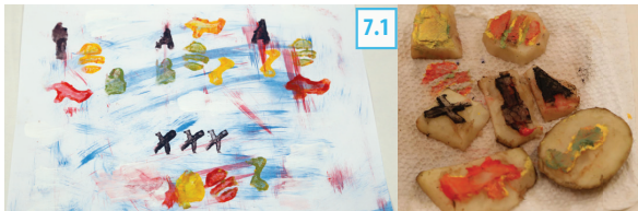
Figure 6. P7’s stamps and visualization show an example of a visualization without annotations.

Annotating Guides. In 7/10 cases, participants laid down partial annotations prior to stamping on their paper, or while continuing to make stamp marks. In 6/21 visualizations, participants created axes or data grouping headers before stamping onto the page, presumably as guidelines for where to stamp.