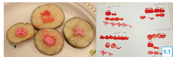
Figure 3. P9's stamps and visualizations show an example of multiple patterns from multiple stamps .

While most stamp patterns were composed from a single shape, participants P1 and P5 composed modular stamp patterns by combining several smaller stamps. P1 composed several axes stamps together to create annotations for their visualization (1.1), as shown in Fig. 2, while P5 composed Chernoff faces [7] (5.1) and stacked circles (5.2).