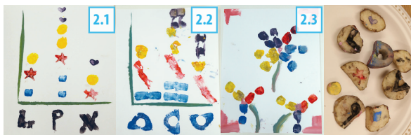
Figure 4. P2's stamps and visualizations. Visualizations 2.1 and 2.2 are dot plots, while visualization 2.3 is stamped in a way to look like flowers.

Dot/Scatter Plots and Matrices (8/21): We classify visualizations as dot/scatter plots and matrices if they encode data values (e.g., enjoyment, cost) along visible categorical and numerical axes. While dot/scatter plots and matrices are defined as the second-most numeric representations along the original continuum, this is not necessarily the case with our visualizations. Visualizations 2.1 and 2.2, shown in Fig. 4, are represented as dot-plots; however, the data is highly abstracted and it is difficult to extract the raw values. Visualization 5.1 and 5.3, shown in Fig. 5, are matrices defining enjoyability over different days and locations, but numerical data ( Cost ) is either not encoded (as is the case with 5.3), or has been transformed into binned categories (as is the case with 5.1).