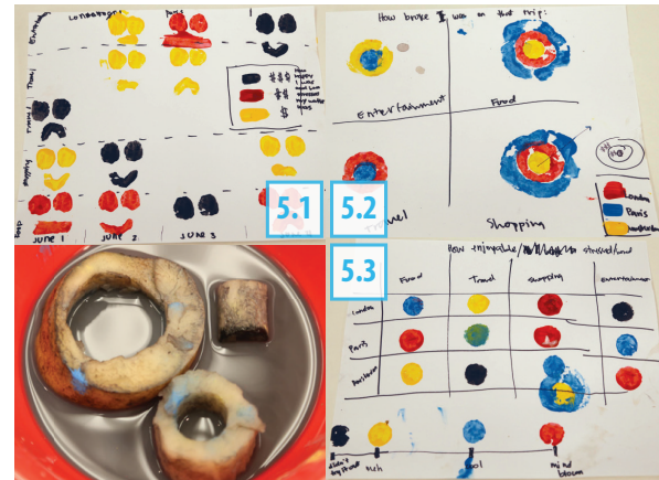
Figure 5. P5's stamps and visualizations. Visualizations 5.1 and 5.3 are matrices, while visualization 5.2 falls under the Other category.

10.2 uses spilled paint stains on a sheet of paper to represent money spent over different days.